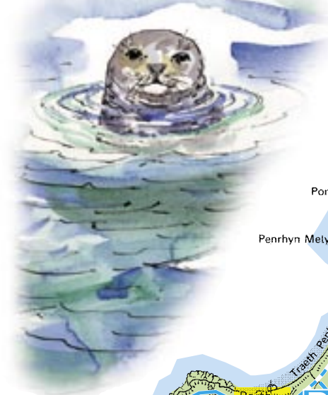
Morlo llwyd/Grey Seal

Mae'r llwybr wedyn yn ymdroelli'n hamddenol ar hyd yr arfordir. Dyma wlad y 'porthydd' gyda phob un ohonynt gyda'i nawn unigryw ei hun. Diolch i galedwch y graig, a bobwyd gan lafa chwilboeth, mae'r ardal hon wedi galluogi trigolion Llŷn i ddbynnu ar gyfuniad o gynnyrch môr a thir i'w cynnal. Fel cilfachau bach tywodlyd mae'r 'porthydd' megis Porth Ysgaden a Phorth Colmon yn ddelfrydol i lansio a glanio cychod ac er mai crancod a chimychiaid yw'r prif ysbail heddiw ar un amser dibynnai rhan helaeth y boblogaeth ar lanio penwaig.